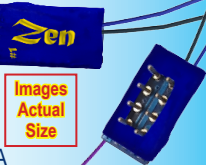
Images Actual Size